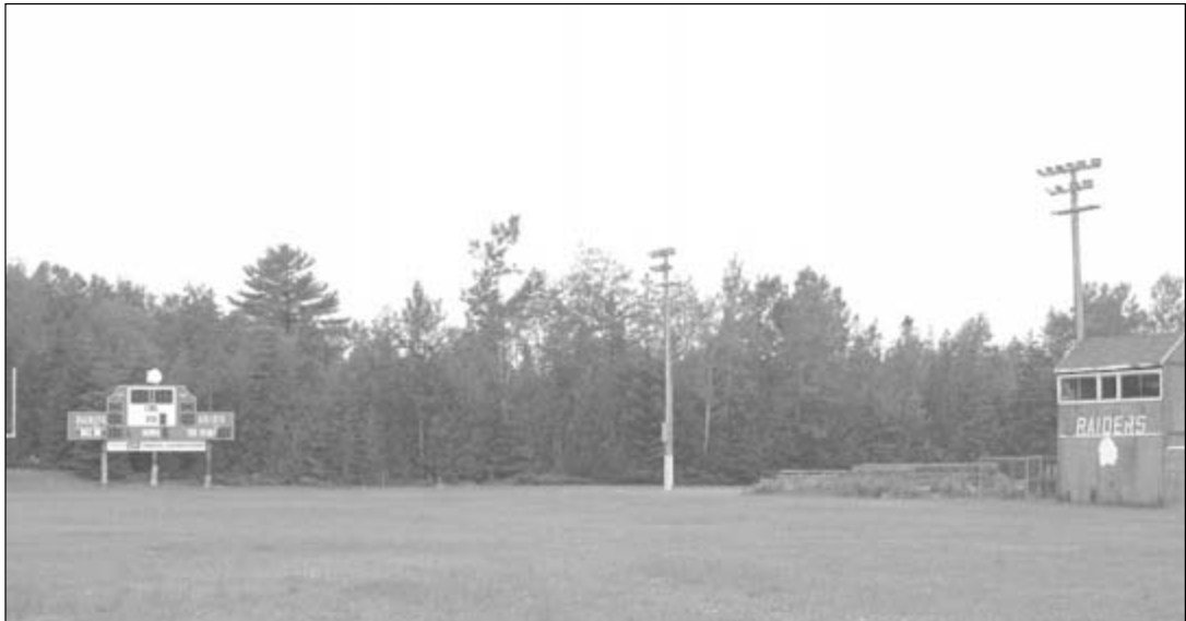
The press box and scoreboard at the old Raiders football field.