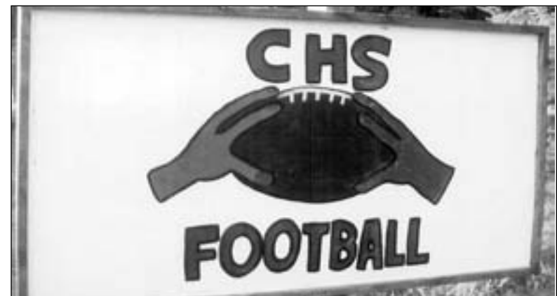
Above photograph: Cedarville fans displayed a number of outstanding signs in town before the game and this one was true to fact as the Trojans improved to 10-0 after defeating Pickford. Lower photograph: This sign was east of the school that shows a green hand and red hand holding the football, to signify the Cedarville/DeTour relationship during the 2005 season.