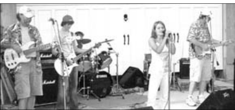
The Beach Chickens will perform Friday night, August 11, in downtown Hessel at a free street dance.