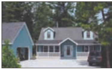
17791 E M-134, DeTour Beautiful home-- view of sand dunes and Lake Huron. 3 brm, 2 bath, Cape Cod home with fireplace, covered porch. Garage, workshop and office. Lovely landscaping with flowers and waterfalls. Walk by the water on the sandy beach and swim anytime you want to. 06-869 $225,000