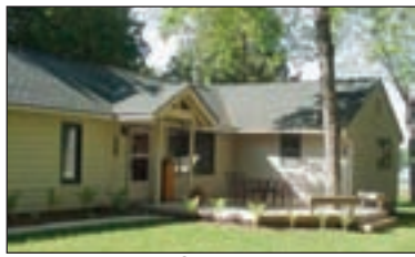
1256 E. M-134 CEDARVILLE - 142' of sandy beach, spacious 3 BR, 2 bath, furnished cottage. 2 decks. Kitchen open to living room, great sauna. View of lake from all rooms, southern exposure. Immediate occupancy. (04-93365) $309,900