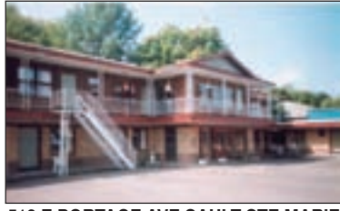
518 E PORTAGE AVE SAULT STE MARIE - Doral Motel w/view of the St. Mary's River near Soo Locks! 19 units plus living quarters upstairs. Outdoor heated pool & hot tub. Many updates, very cozy & comfortable rooms. (04-93969) $189,500