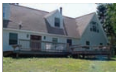
2085 S HILL ISL RD CEDARVILLE - 110' Lake Huron frontage w/4 BR, 3 bath home. Deck, attached garage & extra garage. Darling guest cottage on the shore. Many updates. (06-803) $469,500