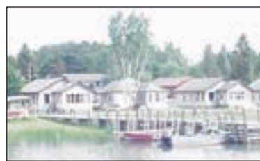
446 E. GROVE ST CEDARVILLE - 200' Lake Huron frontage w/3 cottages, 2 BR & 1 bath each. Close to town, right on the shore, wonderful view of boat traffic & sunsets. (06-243) $395,000