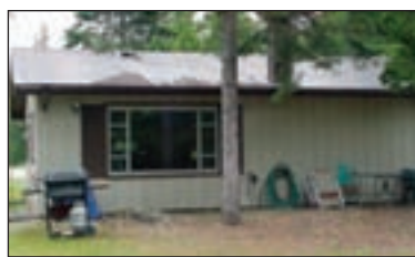
1400 S LAKESIDE CEDARVILLE - 98' Lake Huron frontage w/recently updated, modern, bright cottage. Long, sloping, wooded lot to lake. Boat dock & pretty view of lake. (06-758) $214,900