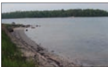
2460 FOREST LANE CEDARVILLE - 300' Lake Huron frontage. Beautiful, wooded lot on county road. SE exposure, high elevation, deep water, variety of trees, fantastic view & great shoreline. (06-223) $790,000