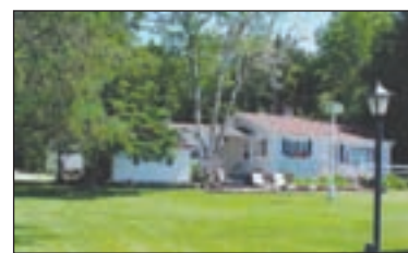
1850 S HILL ISL RD CEDARVILLE - 125' sandy beach w/2 BR cottage, boat dock, bunkhouse w/bath, deck, sitting area, attached garage & 20x30 outbuilding. A true Les Cheneaux gem. (06-691) $319,000