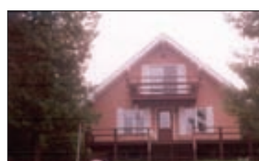
1873 S. LAKESIDE CEDARVILLE - 150' Lake Huron cottage/year-round home. Spacious 3 level living includes 3 BR, 2 bath w/large garage & deck on deep water. 2 extra cottages, nicely landscaped. (05-928) Reduced! $294,000