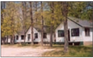
484 S. HILL ISL RD CEDARVILLE - Beautiful sandy beach, good swimming. 3 seasonal cottages on Lake Huron. Southern exposure. Village sewage system & black top road. Natural woodsy setting. 2 outbuildings. (04-92170) Reduced! $329,000