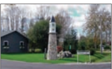
634 E GROVE ST CEDARVILLE - Cedarville R.V. Park now an adult condo. Waterfront & water view lots available w/southern Lake Huron exposure. 50 sites available. Common amenities include docks, recreation bldg, bath house, laundry & fish cleaning station. (05-983) $10,500-$51,500 each