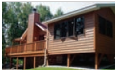
1885 S. LAKESIDE CEDARVILLE - 100' of waterfrontage on deep water. Absolutely darling cottage, 2 BR, 2 bath, fireplace, garage plus 'tinkers' workshop. Wrap around deck. Everything about this cottage is unique & very special. Portable L-shaped dock included. (06-735) $265,000