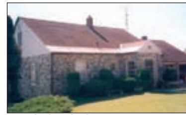
446 E GROVE ST CEDARVILLE - 350' on Lake Huron - Les Cheneaux Islands home with 6 waterfront rental cottages. View & sunsets over Lake Huron are phenomenal. Enjoy an Up North life style on the lake. (04-92569) Reduced! $795,000