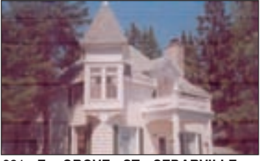
231 E. GROVE ST CEDARVILLE - Historical year round or summer home overlooks Cedarville Bay w/170' of waterfrontage. Includes 2 BR year around guest cottage with great water view and oversized 2-1/2 car garage with workshop. (04-94112) Reduced! $499,000