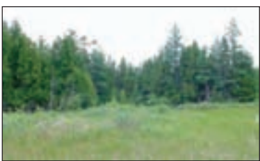
POINT RD DETOUR - Vacant 1.2 acre building lot. Lots of beautiful evergreen trees. Quiet location only 1 mile from downtown DeTour. Choice building site. (06-741) $40,000