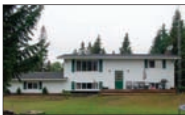
43 S KASPER CEDARVILLE - Great 3 BR, 2 bath w/finished lower level on big corner lot. New carpet, nicely painted. Many updates. Walk & shop in Cedarville. (06-852) $129,900