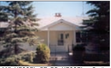
997 HESSEL PT RD HESSEL - Darling waterfront cottage/home. 87' crib dock, blacktop driveway, decks, 3/4 bath in basement, nicely landscaped & ready to move into. (04-92117) $250,000