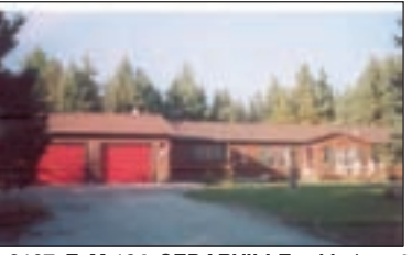
2167 E M-134 CEDARVILLE - Modern 3 BR, 2 bath home close to Cedarville. Attached garage & new deck on a woodsy lot. Attractive pond on a private location. (05-695) $110,000