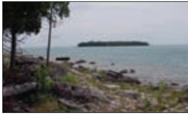
PRENTISS BAY RD CEDARVILLE - 100' vacant wooded lot w/southern exposure. Tall evergreens & cedars abound on this natural parcel of beautiful waterfront. Private road access. (05-21) $156,000