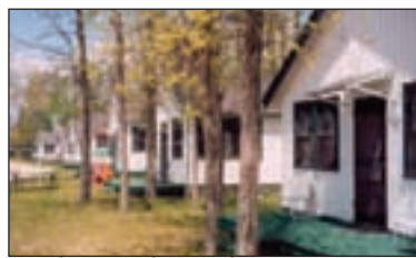
484 S. HILL ISL RD CEDARVILLE - 100' crib dock w/ 70' flotation extension. 40'x32' pole barn & 3 outbuildings. 5 vacation cottages right on the sandy shore of Lake Huron. Southern exposure beautiful location. (04-92172) Reduced! $645,000