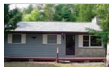
37120 S HAZELWOOD LANE DETOUR - 3 BR home w/stone fireplace, hardwood floors & appliances. 12x12' 2 car garage, 12x8' storage building, 2 acres of land. Home protection plan. (05-823) $84,900