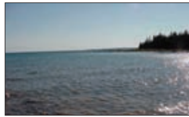
S DEER PT TRAIL DETOUR - (2) 200' vacant, wooded waterfront lots west of DeTour on Rice Point. Very scenic view of Lake Huron. Situated on a private road to enjoy the peace & serenity of lakeside living. Building restrictions. (06-612 & 06-613) $200,000/each