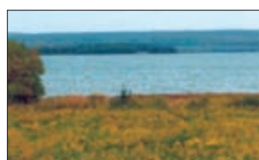
LIME ISLAND DOCK RD GOETZVILLE - Watch the "freighters" in the St. Mary's River. 2 parcels - 146' each vacant waterfrontage on Raber Bay. Awesome view - ready for home of a lifetime or up north cottage. (04-93718 & 05-1075) $94,000 each