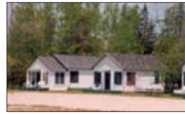
484 S. HILL ISL RD CEDARVILLE - Main home plus 3 guest cottages! Approximately 660' of waterfrontage. View of Cedarville Bay & east entrance from the dock of the cottages. Enjoy the sandy beach and the sunsets. (04-92173) Reduced! $639,000