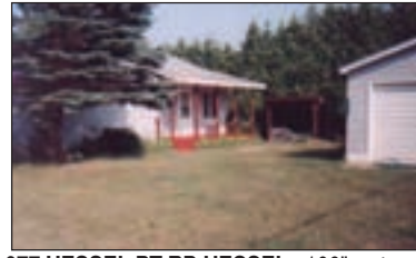
977 HESSEL PT RD HESSEL - 100' waterfront on Hessel Point. Cute home, maintenance free, 2 story, w/90' dock. Natural stone FP. 2/3 BR, 2 bath home with a 24x24 detached garage. Woodsy & private. (04-90988) Reduced! $205,000