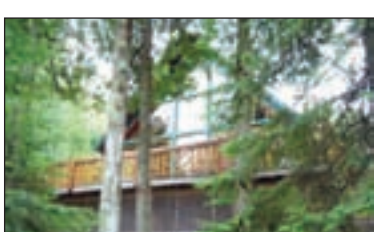
2577 S. CORYELL ISL CEDARVILLE - Located on morning side of Coryell Island w/168' of waterfront & 156' crib dock. Seasonal cedar cottage w/wrap-around deck. Hardwood floors, fireplace, loft, private deck. (05-532) $395,000