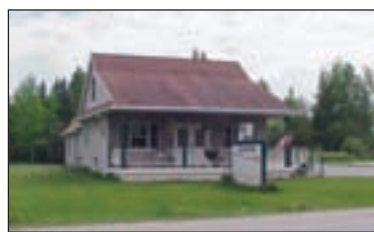
384 E M-134 CEDARVILLE - Budz'n Bloom Flower Shop in Cedarville. Great attractive building both inside & out. Located along busy M-134, this growing business has a great reputation & serves the Eastern UP w/florist needs. (06-579) $199,000