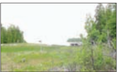
POINT RD DETOUR - Wooded vacant lot w/view of Lake Huron. Approx 1 mile from downtown DeTour Village. Great elevation, view of lake freighters. 2.4 acres total. (06-737) $65,000