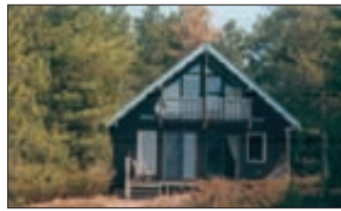
19646 E M-134 DETOUR - 100' Lake Huron w/darling 3 BR chalet, 1 1/2 bath, bright inside w/many glass doors & windows, great woodsy location. Deck off master BR on second story overlooks Lake Huron. Nice deck on main floor. (06-430) Reduced! $210,000