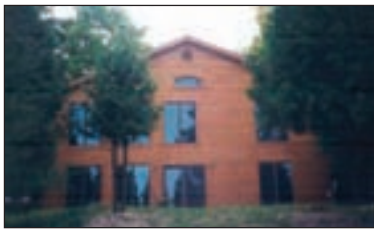
2163 CROOKED TREE LANE CEDARVILLE - 117' waterfrontage in Woodland Park w/ log style custom home/cottage. Boat dock. 3 BR, 2 bath, 2 fireplaces. Renovated in 2000, windows CTC tempered, satellite dish, ceiling fans, hardwood flooring & carpeting, water softener & rock garden w/perennial flowers. (06-29) Reduced! $695,500

101 W. M-134 P.O. Box 411 Cedarville, MI 49719