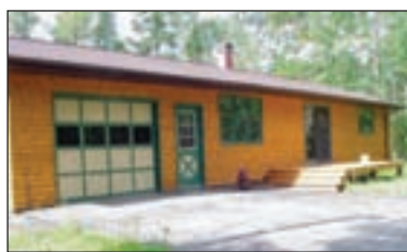
2295 E M-134 CEDARVILLE - Custom built home, wooded lot, attached garage, lots of quality cabinets, breakfast bar, 2 sun decks, bright & cheerful. New carpeting, move in condition. Recently updated & really cute. (06-74) $137,000