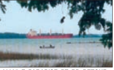
20085 E PARADISE PT RD DETOUR - 550' waterfront on St Mary's River w/wavesome view, beautiful private point, has septic system, drilled well. (05-1081) $375,000