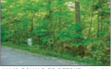
000 McDONALD RD DETOUR - (2) 150', (1) 160' & (1) 190' parcels on beautiful Caribou Lake. Wooded lots. (05-473,05-474,05-475 & 05-476) $45,000-$78,000