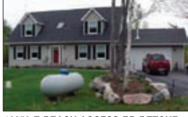
18358 E BEACH ACCESS RD DETOUR - 372' waterfront 3 BR, 3 bath home on Caribou Lake w/2 car attached garage, quality built. Sandy beach. 60' of dock, 4 outbuildings. 12 acre parcel. (05-420) $348,000