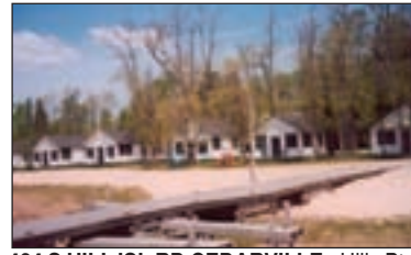
484 S HILL ISL RD CEDARVILLE - Hills Pt. Resort. 970' of waterfrontage, 11 cabins, owner's home, dock, 5 outbuildings & pole barn on Les Cheneaux's best sandy waterfront. Extensive dock for boats. (04-92169) Reduced! $1,530,000