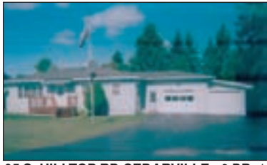
95 S. HILLTOP RD CEDARVILLE - 3 BR, 1 1/2 bath family home. Spacious living room. New vinyl siding, paved driveway, natural back yard, big cedar trees give privacy for the sundeck. Immediate occupancy. (04-93851) Reduced! $110,000