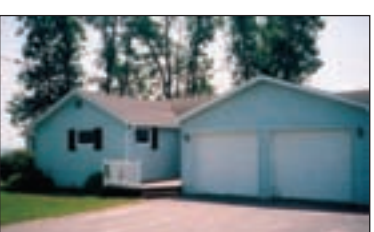
794 E. LAKE ST. CEDARVILLE - Located on Cedarville Bay, cottage/home with 126' of waterfrontage, fantastic views from large deck! Many updates. Custom woodwork, stone fireplace & more. Walk to downtown Cedarville. (05-72) Reduced! $229,000