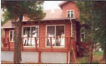
1555 LIGHTHOUSE RD DETOUR - Log home w/260' of frontage overlooking St. Mary's River & Drummond Island. Breathtaking view. 16x12 sunroom & 24x40' pole barn. (05-177) Reduced! $296,000