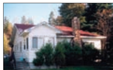
1798 S HILL ISL RD CEDARVILLE - Cute cottage/home on 100' Lake Huron. Sandy beach, dock & garage. Evergreen trees. A special lot among the Les Cheneaux Islands. (06-504) $275,000