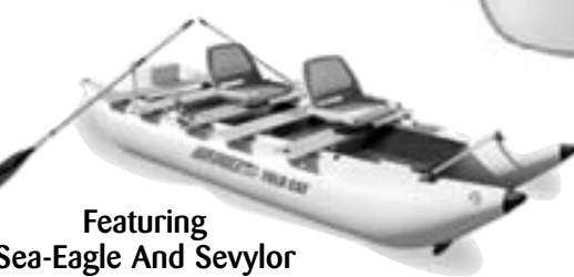
Featuring Sea-Eagle And Sevylor