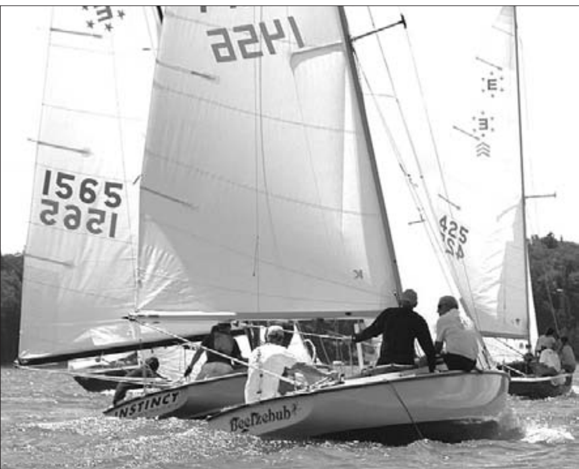
The crews of Instinct and Beelzebub come in close contact during one of the Les Cheneaux Yacht Club's Ensign Fleet 31's summer sailing race series in the Les Cheneaux Islands this summer.