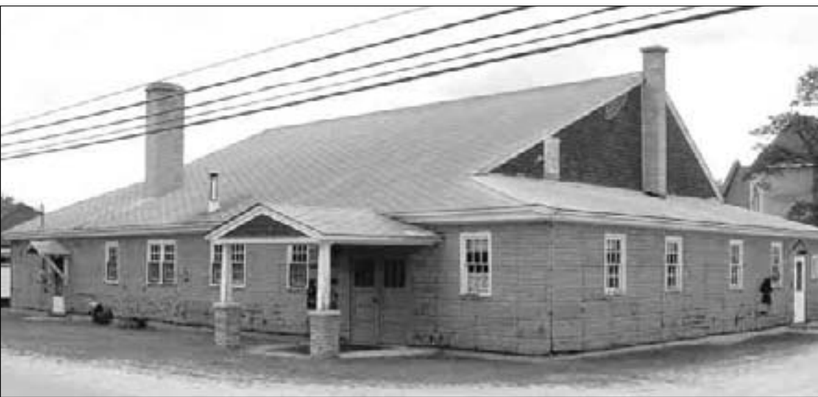
The Sacred Heart Parish Hall in DeTour Village needs repairs the parish cannot afford, so the Eastern Upper Peninsula Fine Arts Council has proposed raising the money to renovate the place and make it a fine and performing arts center that the community and church will have access to.

The Fine Arts Council can be contacted by e-mail at info@eupfac.org, or by calling (906) 297-8103. Donations can be mailed to Eastern Upper Peninsula Fine Arts Council, P.O. Box 202, DeTour Village 49725.