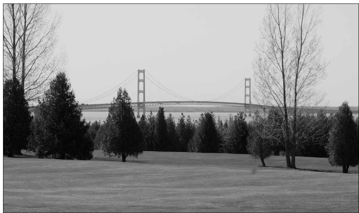
The view of the Mackinac Bridge from across number 3 and number 6 at the St. Ignace Golf Club.

The trip can continue west to the 18 holes at Wild Bluff in Brimley and end with a round of 18 holes at the Newberry Golf and Country Club and nine holes at Hiawatha Golf Club in Naubinway.