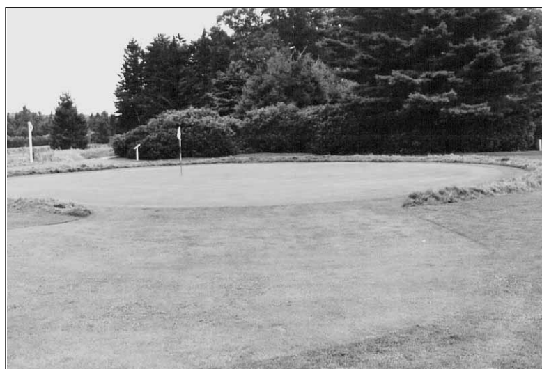
The traditional clubhouse and the ring around number 3 at Wawashkamo Golf Club.