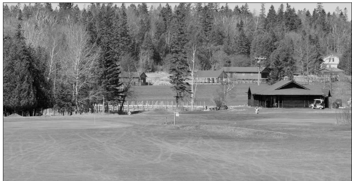
Pictured from the tee on number four at Les Cheneaux Golf Club to the clubhouse and the Snows Channel.