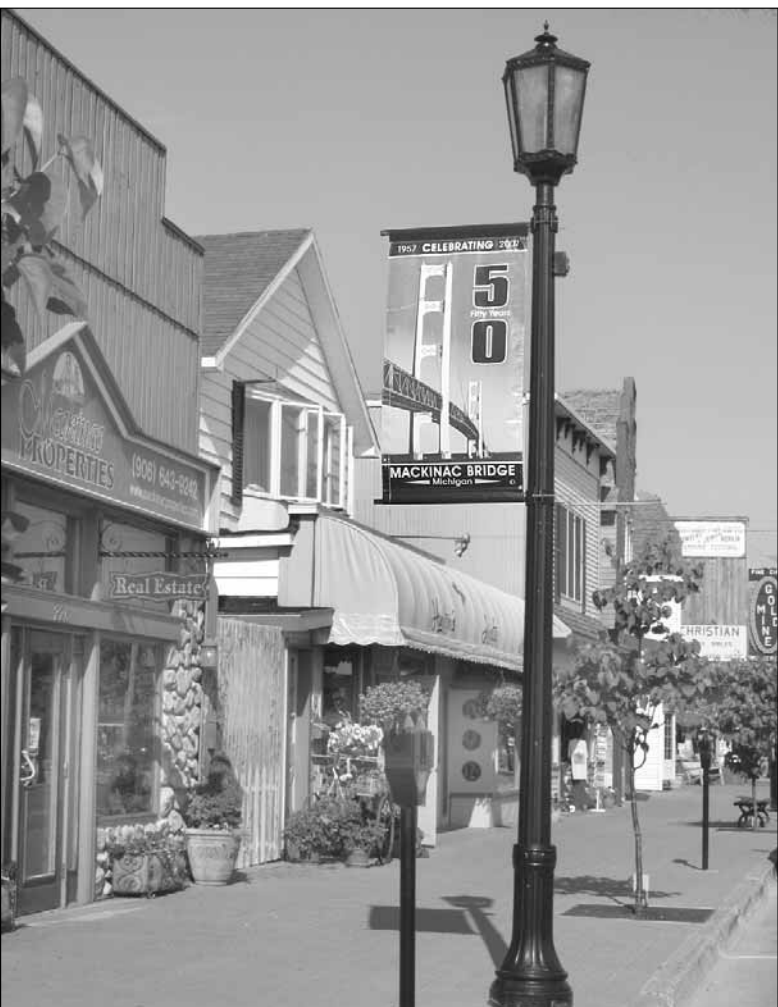
State Street in St. Ignace is lined with banners marking the 50th anniversary of the Mackinac Bridge. The banners will decorate the town through the summer.