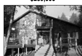
N3882 St. Martin Pt.-Lake Huron Home $459,000