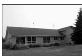
W2779 Brevort Lake Rd. $239,000