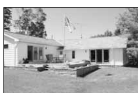
1929 Shore Dr.-Evergreen Shores Lake Huron $349,000