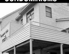
CLEARWATER U.S.#2 Brevort, Lk. Mich.