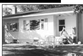
W3055 Oak St-Pte. Aux Chene Lk. Mich. $265,000