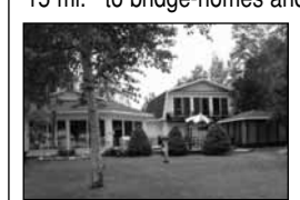
EAST LAKE-small wilderness type lake, 25 mi- from bridge-camps-building site, cottage

BREVORT LAKE -4400 acre all-sports lake, 15 mi. to bridge-homes and vacant parcels