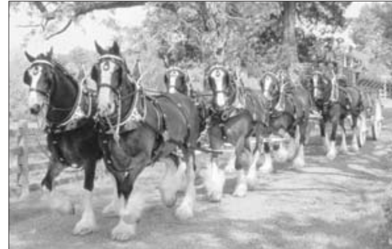
An eight-horse Budweiser Clydesdale hitch parades through the countryside, towing the traditional red and white Budweiser wagon. The Clydesdales will be in the Mackinac Straits area starting July 23 to celebrate the 50th anniversary of the Mackinac Bridge. They're scheduled to appear on Mackinac Island, in St. Ignace, and in Cedarville.