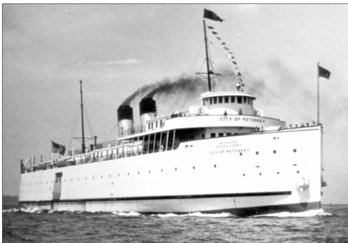
After the reception guests were invited to cruise back to the Straits. Highway Department personnel drove guests' cars to Mackinaw City so they would have a way home. The only snag was that too many people took advantage of the invitation, and planners had to quickly "uninvited" some guests. The local Boy Scout color guard had to give up the ride, but later got a private trip aboard when the Petoskey sailed to the River Rouge shipyard.

The bypass proposal immediately raised red flags for St. Ignace business people. The Mackinac County Board of Supervisors met immediately and over the next two