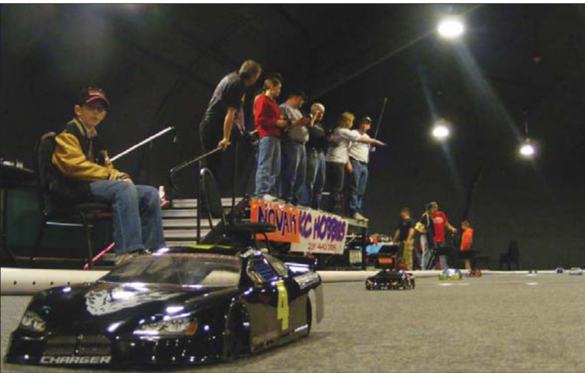
More than 50 people participated in KC Hobbies and Raceway's radio-controlled car racing tournament at St. Ignace's Kewadin Shores Casino Saturday, May 3. Racers enjoyed competing on a 320-foot oval track.