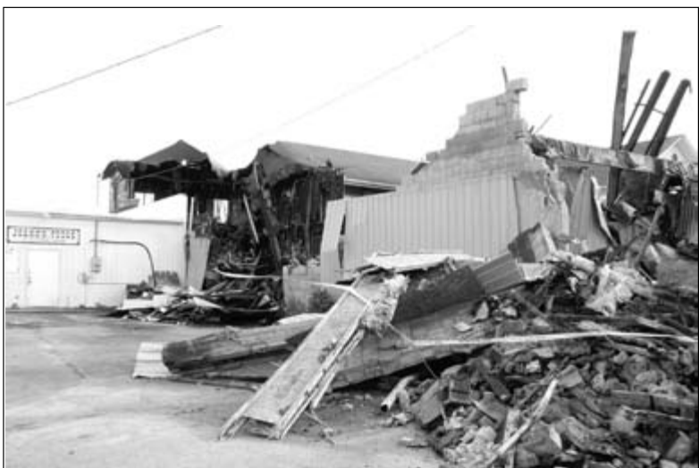
Part of the former Stimpson House Hotel, one of Mackinaw City's oldest buildings, lies in rubble Thursday, June 26. A fire Monday, June 23, affected Joanne's Fudge, Oak Tree Gifts, Shirt Tales, The Popcorn Factory, and a new, unnamed T-shirt shop. All but Oak Tree and the T-shirt shop are open or are shortly to reopen.