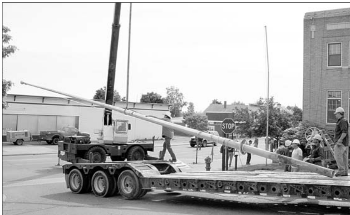
A new flagpole, delivered to St. Ignace City Hall on State Street, is lifted from the truck bed by members of the Department of Public Works, working with Maverick Construction and using a 60-foot crane. The 50-foot pole was set in place Tuesday morning, June 24. The pole was