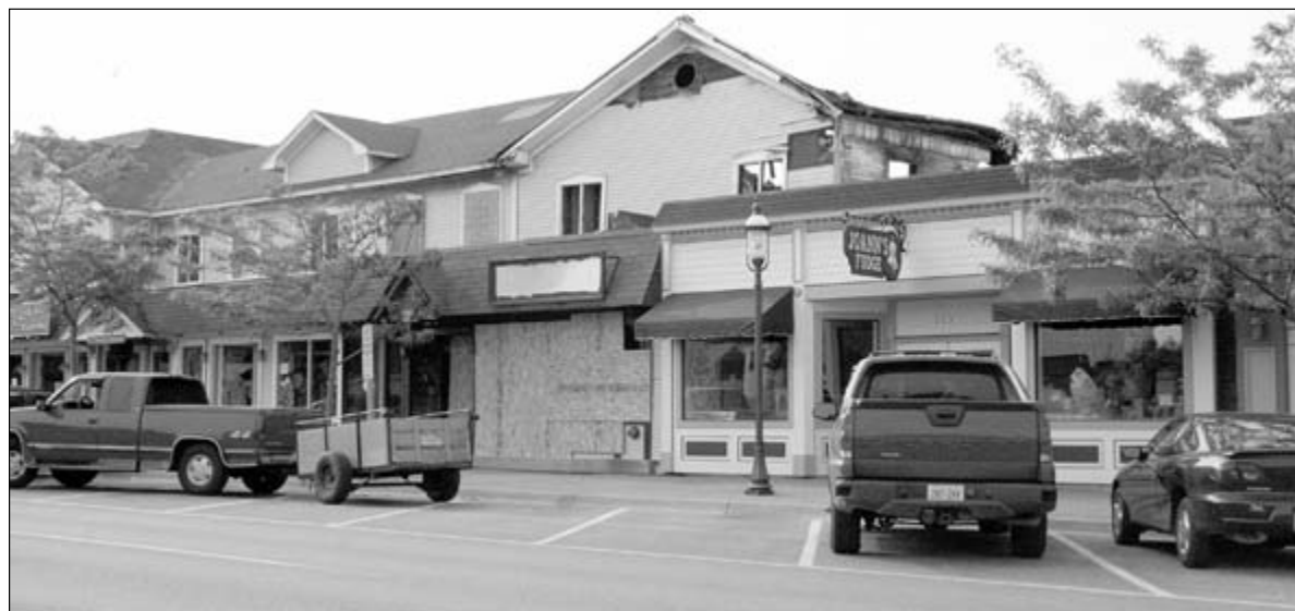
Firefighters from St. Ignace, Mackinaw City, Mackinac Island, and several northern Lower Michigan departments managed to prevent the spread of a blaze on East Central Avenue in Mackinaw City Monday, June 23. It destroyed a T-shirt shop, led to heavy damage at Oak Tree Gifts, and caused minor damage to three businesses on the block.

He learned of the fire Monday at 2:45 p.m., shortly after it started. By 3 p.m., he was on a boat from the Island to Mackinaw City, where he watched fire crews battle the blaze.