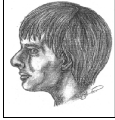
These police sketches show the unidentified man.