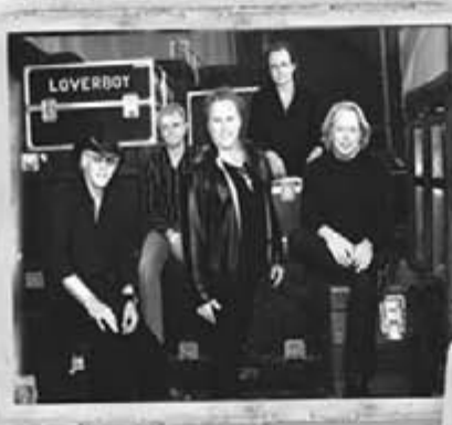
Loverboy Thursday, November 13th Sault Ste. Marie, Michigan