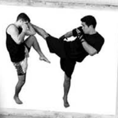
Thunder from Down Under Sunday, November 16th St. Ignace, Michigan