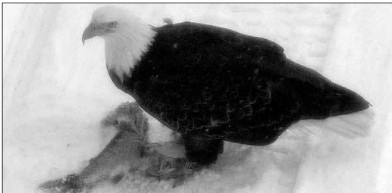
The visiting eagle enjoying lunch at Mackinac Island.

by Mackinac Island Public School Sunday, December 14, and Tuesday, December 16, it was on Windermere Point. There is always something special to see on the Island.