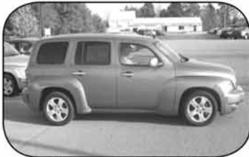
2007 Chevy HHR LT 4 dr., 4 cyl., grey, auto., A/C, CD, pwr. windows/locks, rear defogger, cloth $12,950