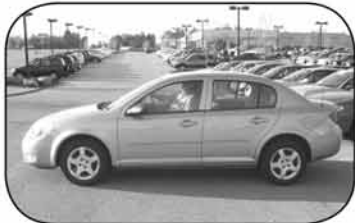
2005 Chevy Cobalt LS 4 dr., 4 cyl., tan, auto., A/C, CD, pwr. locks, rear defogger, green cloth $9,450