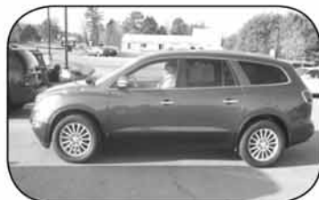
2008 Buick Enclave 4 dr., V6, tan, auto., A/C, CD, pwr. windows/locks, rear defogger, leather $26,950