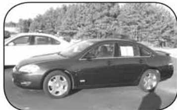
2006 Chevy Impala SS 4 dr., V8, blue, auto., A/C, CD, pwr. windows/locks, rear defogger, leather $16,450