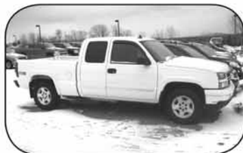
2006 Chevy Silverado Extended cab, white, pwr. locks $17,495