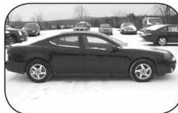
2004 Pontiac Grand Prix GT 6 cyl., black, auto., A/C, CD, pwr. windows & locks, rear defogger, cloth $8,950

"The people you know, the service you expect"