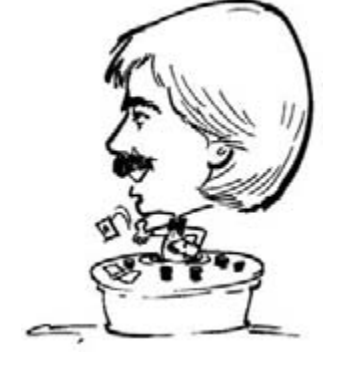
Mark Pilarski worth to them.

Oh, and don't forget to use your slot club card every time you play. Casinos offer you the ability to "comp yourself" by using one of their player's club slot cards. It is generally based on the number of coins you cycle through a machine, so you might as well get credit for all those nickels, quarters or dollars you're inserting. Shop the casinos for comp value and just see how much you are