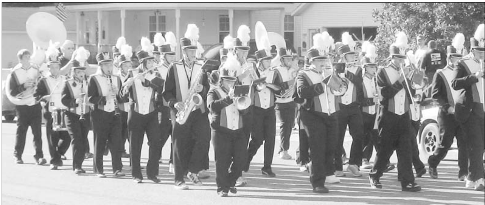
Rudyard marching band performs in the homecoming parade Friday, September 18.